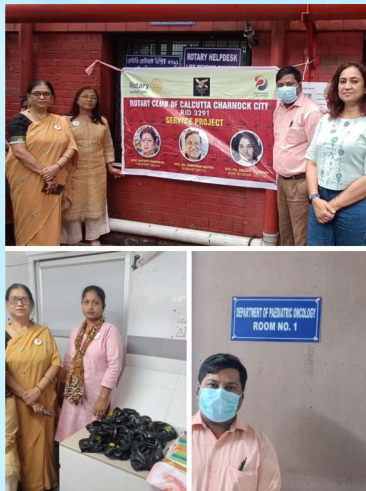
Monthly visit to SSKM Hospital